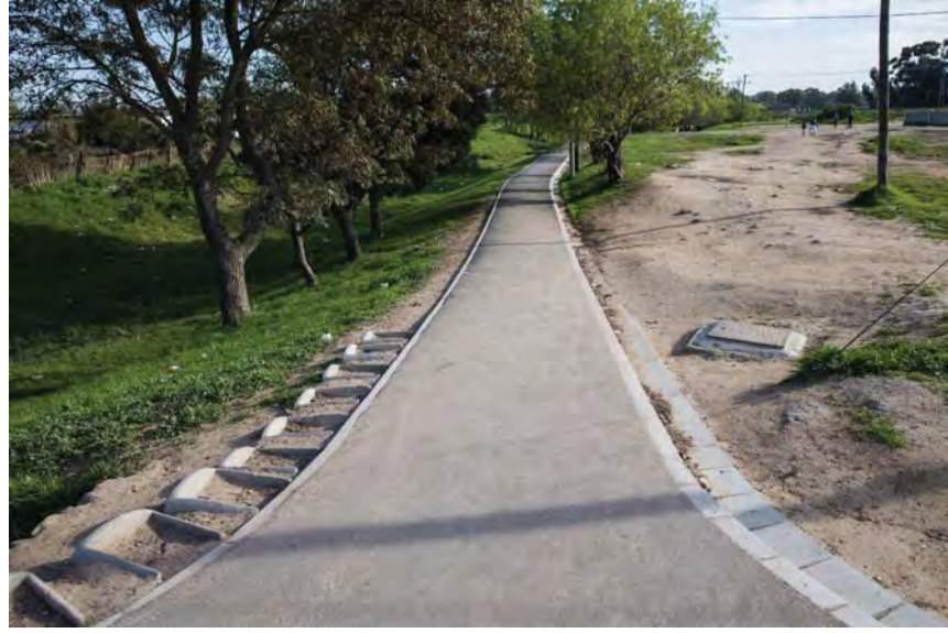
Photo's 6 and 7- Before and After Pathway between Groenvlei Road and Merchant Road

Version 0.6 (Draft) Page 12 of 23 29 August 2017 Version 0.6 (Draft) Page 13 of 23 29 August 2017