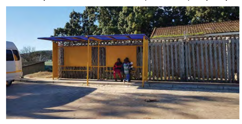
1 No. shelter installed by the Kayamandi Taxi Rank in Masitandane Rd.