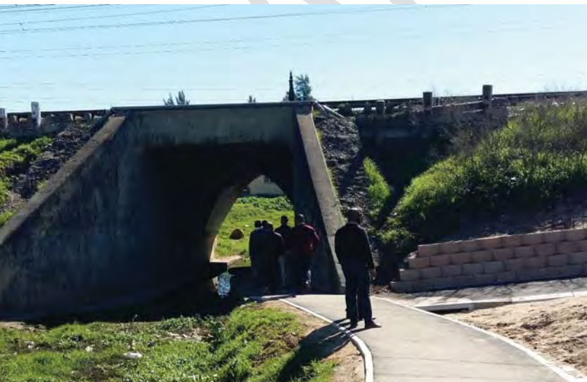
Photo's 8 and 9 - Before and after - pathway running through the subway - Groenvlei to Merchant