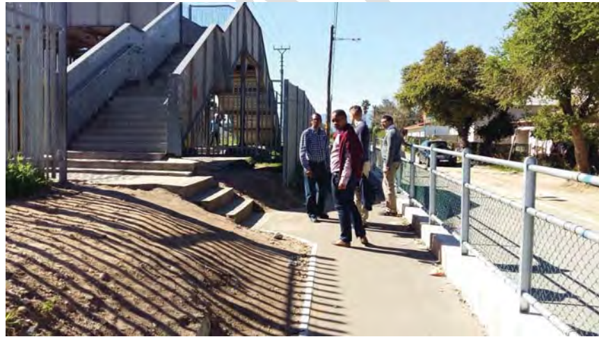
Photo's 13 and 14- Before and after at the railway crossing Beyers Street sidewalk ramp

Version 0.6 (Draft) Page 8 of 23 29 August 2017 Version 0.6 (Draft) Page 17 of 23 29 August 2017