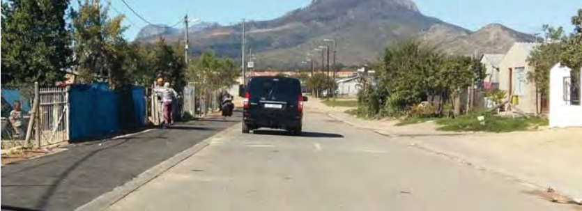
Photo's 11 and 12 - Before and after Adams Road Klapmuts - surfaced left hand side sidewalk

area, as was originally intended. All the projects form important NMT links within the communities within Stellenbosch Municipality.