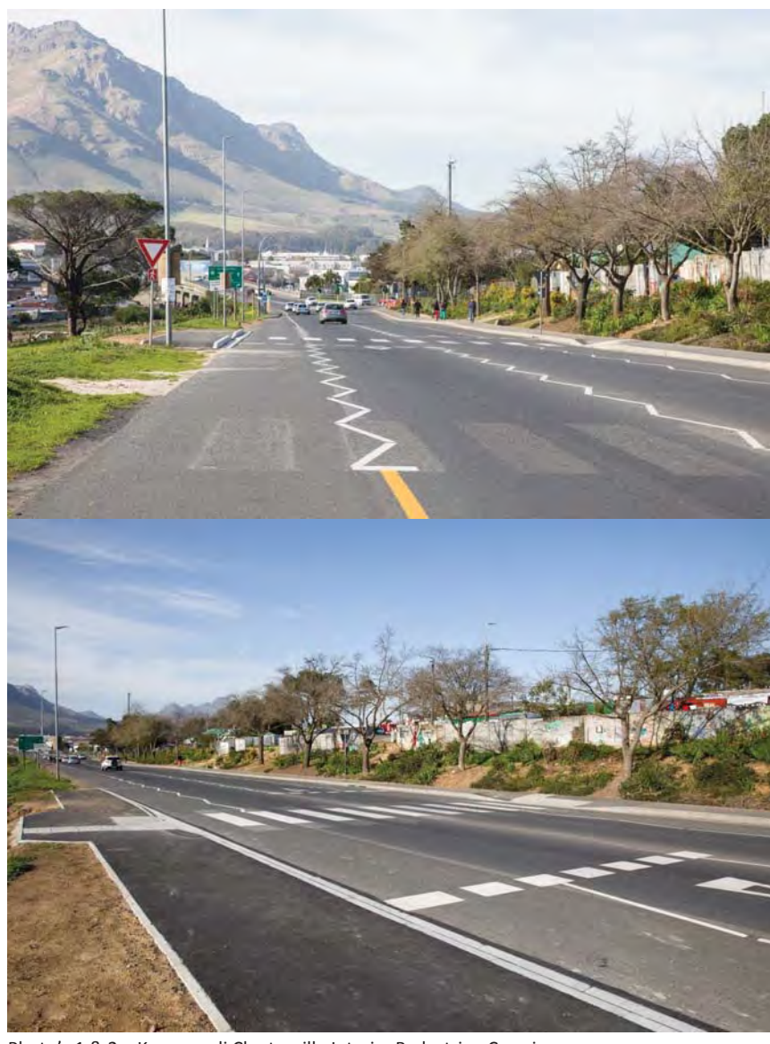
Photo's 1 & 2 – Kayamandi Cloetesville Interim Pedestrian Crossing